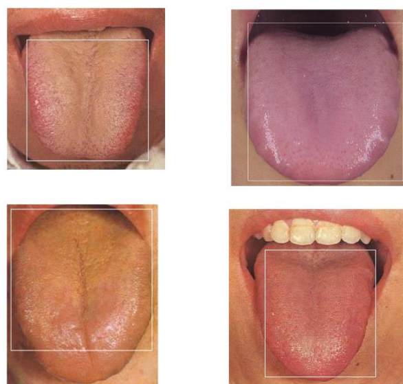
Fig. 3. Tongue segmentation result image.

The gray level integral projection method is used to determine the positional condition of the tongue is slightly harsh, and the photographing light is required to be good, and the collected tongue image basically does not contain other objects. Under such conditions, a better segmentation effect can be obtained. As shown in Fig 3 below, the image inside the white rectangle is the position of the tongue determined by the gray integral projection algorithm, which can accurately locate the position of the tongue, but the lack of part of the non-tongue part in the white rectangle is To a certain extent, it affects the color detection behind.