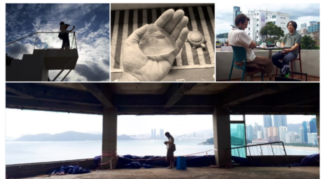
Fig. 1. Still Images from The Old, the New and the Other .

Shot on location in Mipo-Dalmaji, Haeundae district, Busan (Fig. 1)