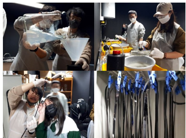
Fig. 3. Super 8mm footage manual development for The Old, the New and the Other .

The post-production process necessitated several careful steps, particularly in regards to the high-quality and the sheer amount of data of the 4K-3D images, and the technical difficulty to even find a computer capable of handling such sizable video files. Rough editing was therefore first done with low-resolution files (proxy editing), then recreated with the full-quality files identically (RAW editing). As for the Super 8mm footage, it was hand-developed at DCTI, then converted into 4K digital files for use in the edit (Fig. 3).