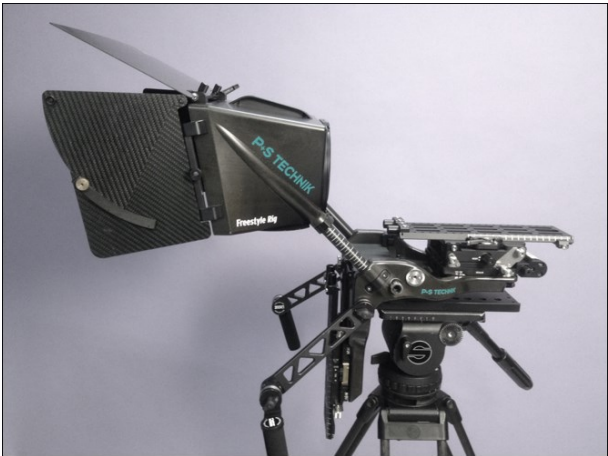
Fig. 6. 3D Freestyle Rig of P+S Technik.

In order to control such parameters on the set, professional production recur to beam splitter rigs. Two camera are aligned in an angle of 45 degrees filming across a semi-transparent mirror. Remote control systems allow to control most parameters in real-time. During the production of the pilot film, a Freestyle Rig by P+S Technik (Fig. 6) was used.