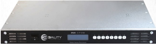
Fig. 7. Stereo Image Processor 2101 (SIP-2101) of 3Ality Technica.