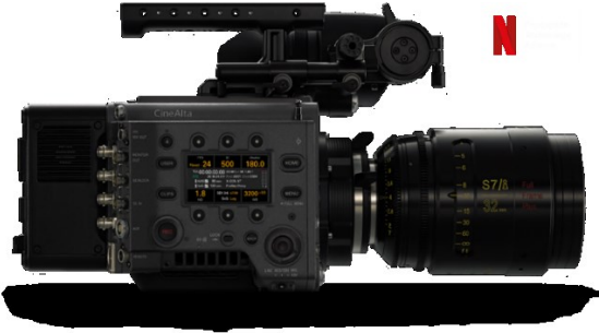
Fig. 5. Sony Venice Digital Cinema Camera.

The camera used for the pilot film production is Sony Venice Digital Cinema Camera (Fig. 5).