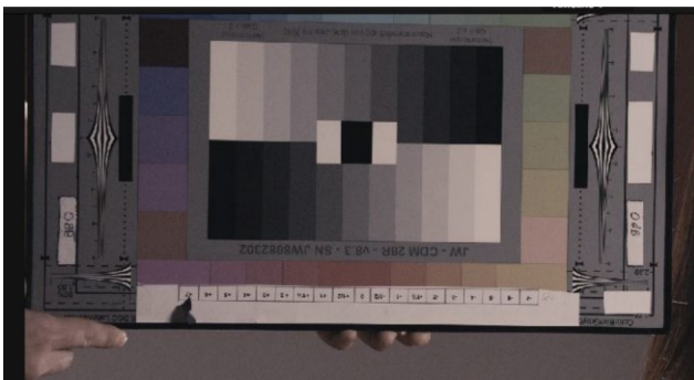
Fig. 8. Lookup Tables (LUTs).

During the editing process, the stereoscopic images are synchronized by their timecode. Proxy clips are edited for faster preview and display on available HDTV via HDMI. The editing involves a preselection of shots and the arrangement of the final timeline containing the narration of the pilot film. In addition to the image, additional effects and sounds can be added to enhance the narration and storytelling.