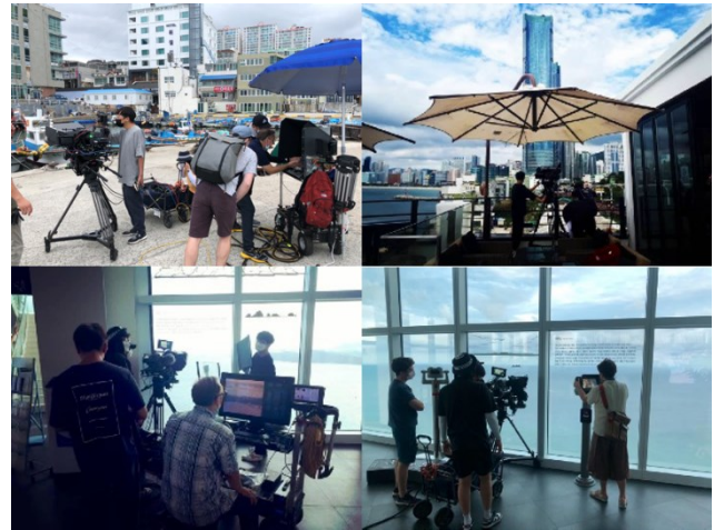
Fig. 2. Stills from the shooting of The Old, the New and the Other .

The technical specificities of the camera equipment, which was provided by the Seoul-based company Dike Co. Ltd., made it so that most locations had to be accessible by car, necessary to power the double-lenses camera, the two recorders, and the control monitors. Indispensable, but demanding and conspicuous, this set-up betrayed the original documentary aspiration of the project but allowed for a more focused and precise mise-en-scène and team dynamic on set.